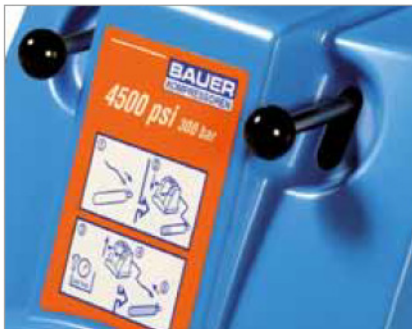
Easy one-hand operation