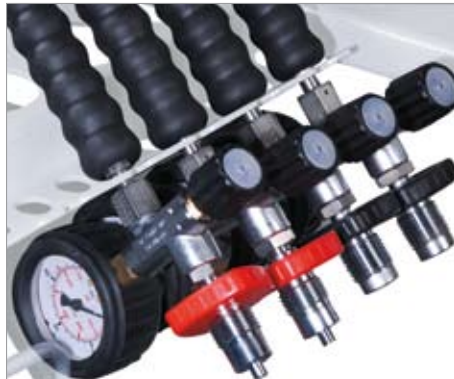
Corrosion free safety filling devices