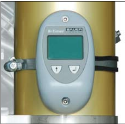
B-TIMER for filter monitoring