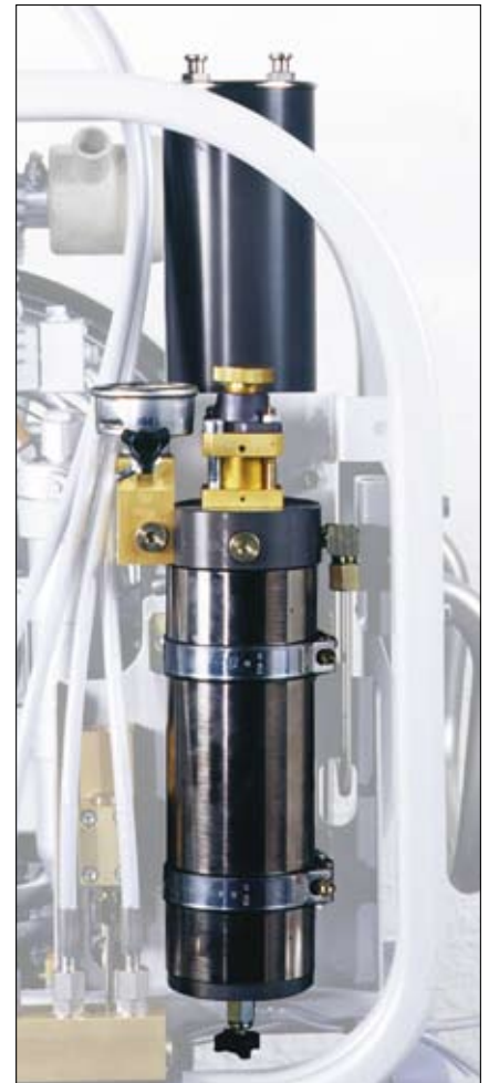
P41 filter system